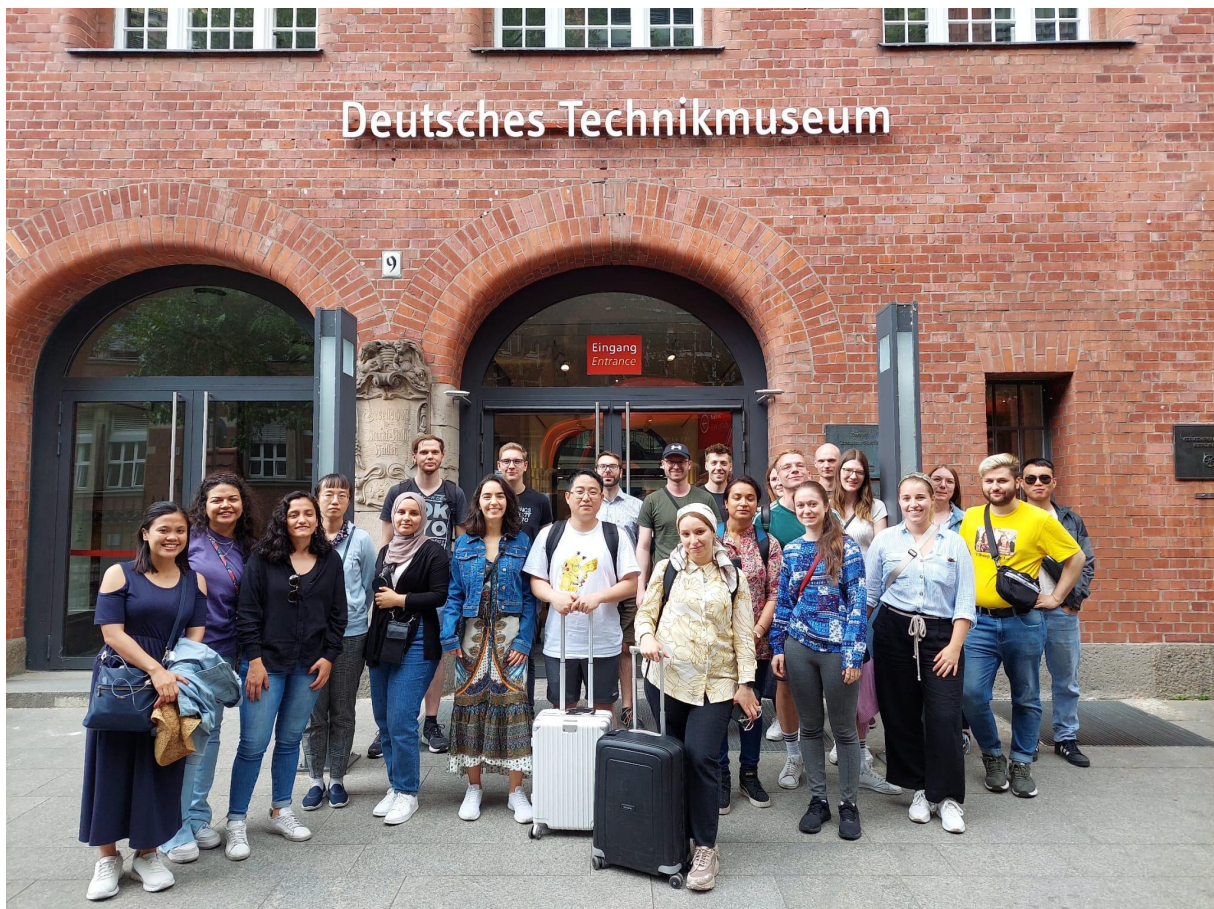
German Museum of Technology on 14 th of June 2023

We started the visit to the German Museum of Technology at around 15:30. The German Museum of Transport and Technology was opened with 1,700 square meters of exhibition space in December 1983. After the development, finally, its name was changed again in 2007 to the current name. We visited the museum freely and collected together at around 17:30 at the main entrance. In this museum, we learned a lot about the development of different technologies, like ships, trains, airplanes, photography and so on.