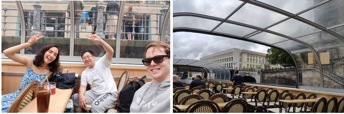
Boat tour in Berlin on 16 th June 2023

On the third day, our retreat came to an end on the 16 th of June 2023. After breakfast and check-out at Hotel. Students could arrange their time by themselves and choose their dream places in Berlin to visit. A bus tour + boat tour ticket was provided to all students. The bus tour route covered nearly all famous places in Berlin and a very attractive boat tour gave students a really nice opportunity to enjoy their time in Berlin. The weather was unfortunately not so good, but we could still enjoy it.