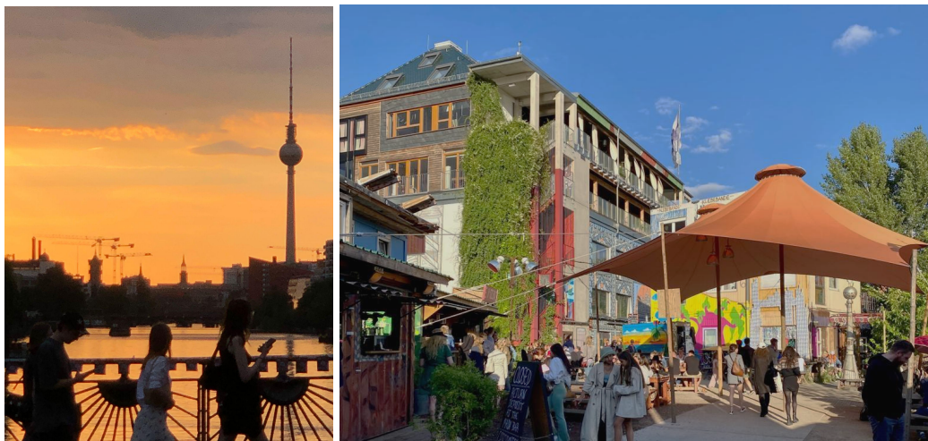
Holzmarkt 25 on 15 th June 2023

On the evening of the second day, we recommended an optional event which took place at Holzmarkt 25 for dinner. Many students took part in this event. Students discuss a lot about the daily life in their PhD career, their plans for the future and many other interesting topics.