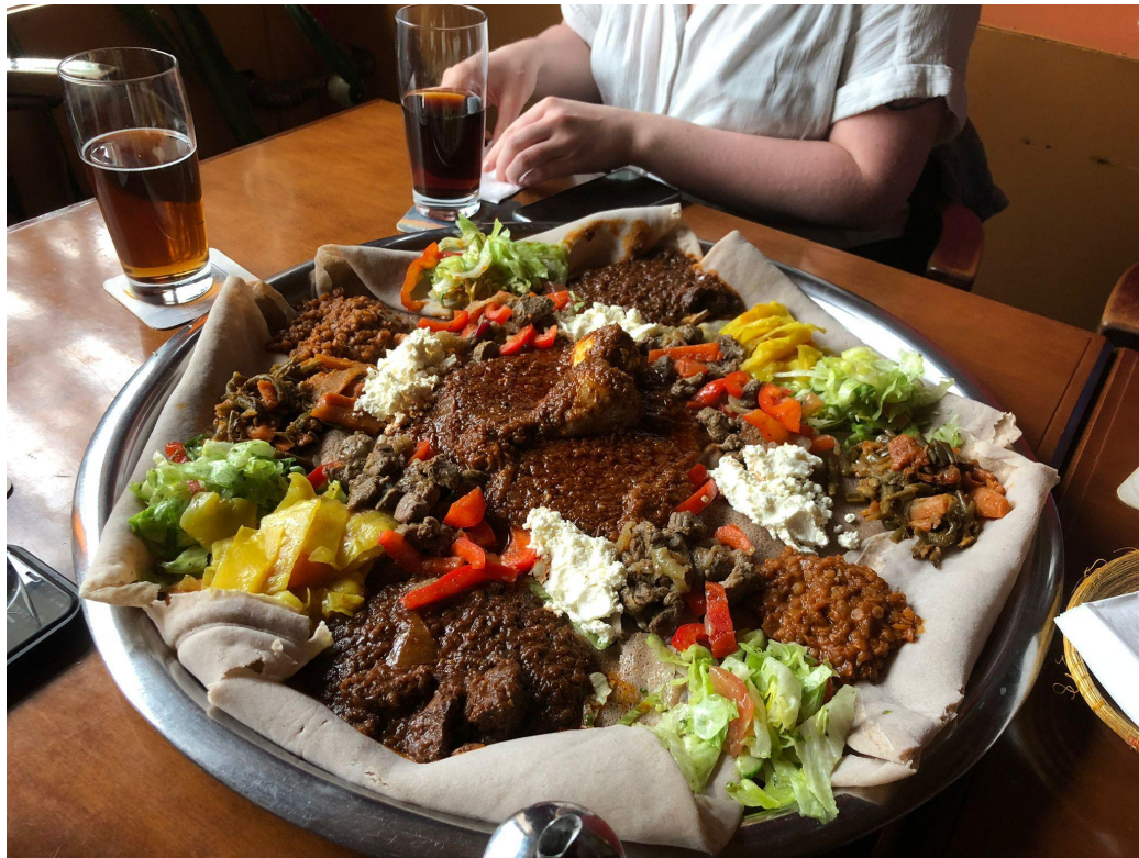
Dinner for the first day (14 th June 2023)

Our presentation section started on the second day from 9:00 to 17:30. Each student had 10 minutes for the presentation and 5 minutes for questions/discussions. Students from different scientific areas also had really nice conversations at the coffee break and lunch break. Contacts, ideas and plans for sample exchange were done. We were very inspired by different presentations that may help our research in the future.