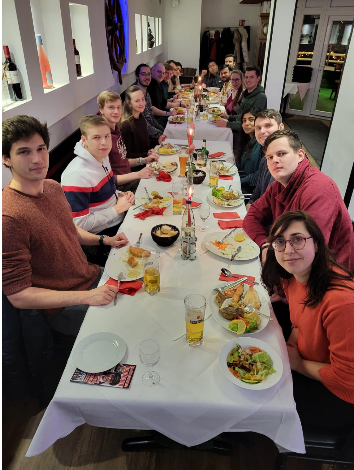
Dinner at Stoertebeker-Fischrestaurant