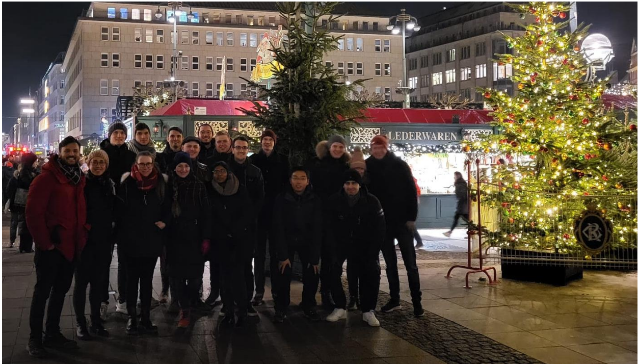
Christmast Market next to the city hall

In the evening, we had dinner in our hostel and afterwards, we visited the Christmas Market next to the city hall, we spent a very lovely time at the city hall Christmas Market, and we started to get to know each other better.