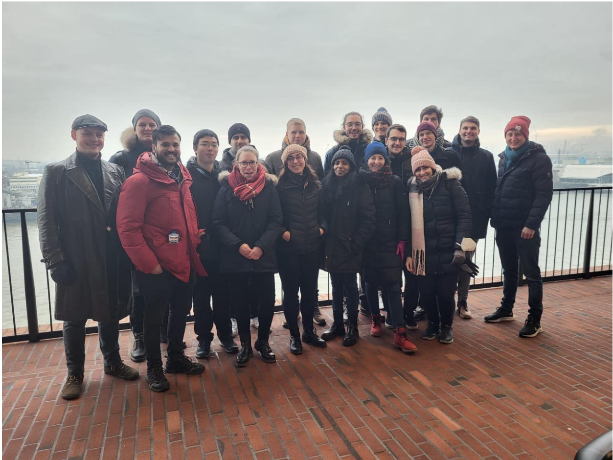
Balcony of Elbphilharmonie Building

On our last day, we started our last event, which was the harbor city tour. We started our tour with a tour guide, and she introduced us to the new harbor city with many explanations. We gave small breaks during the tour and visited different restaurants on our road shortly and tried different foods from different cultures. We ended our tour at the Elbphilharmonie building at 01.00 p.m.