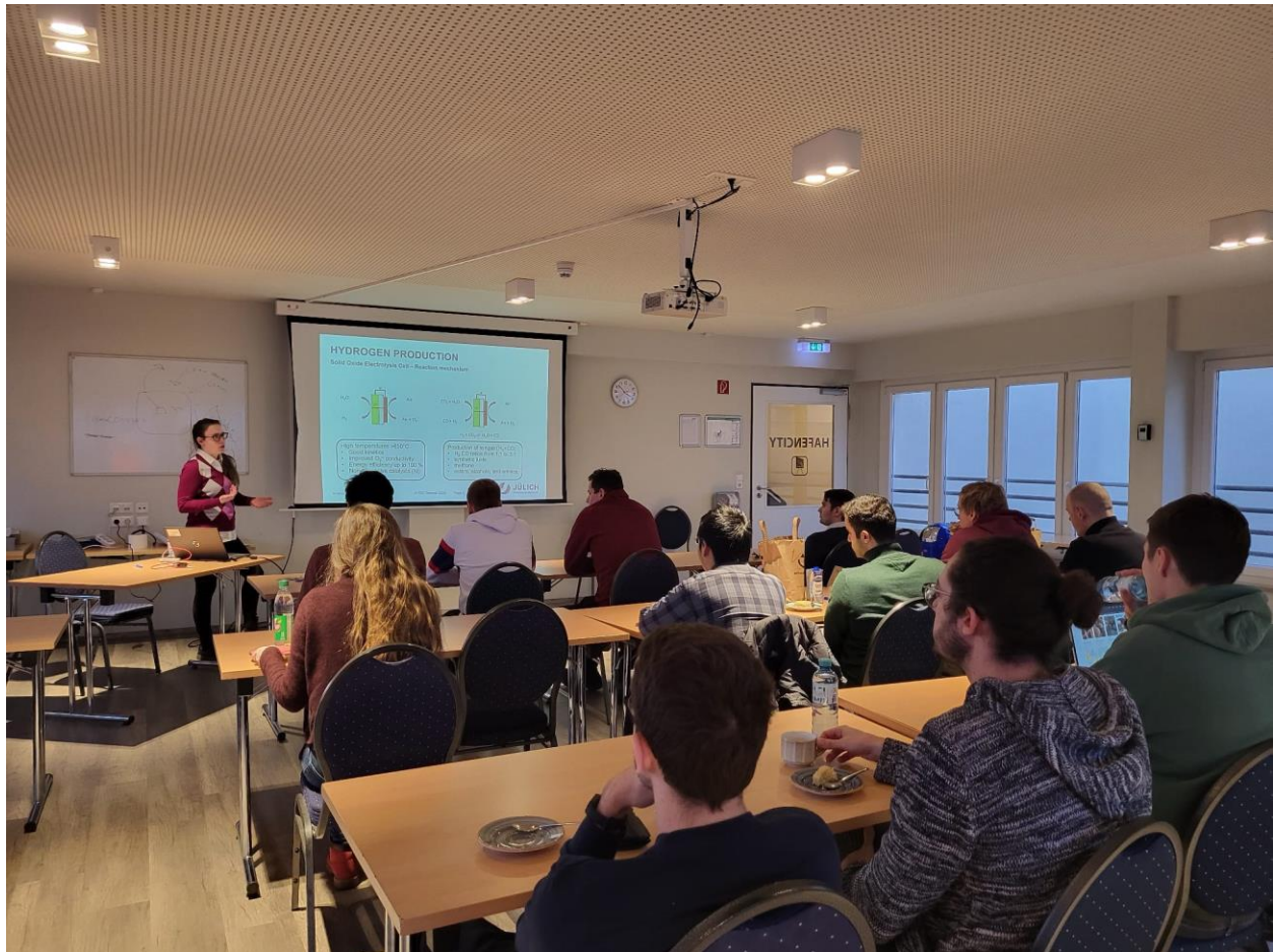
Scientific session of 1 st day

In Hamburg, 18 PhD students from the Forschungszentrum Jülich participated in a wonderful retreat from December 14th to December 16th. Our first day began with a train ride from Köln Hbf to Hamburg Hbf. After traveling by train for 5 hours, we arrived at A & O hostel around lunchtime. In the afternoon, we quickly started our scientific session after having lunch at our hostel. On the first day of our conference, people from different institutes presented their thesis work in 12 minutes, and it was followed by 3 minutes discussion part. We continued our scientific talks until 7pm.