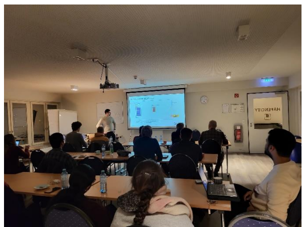
Scientific session from 2 nd day